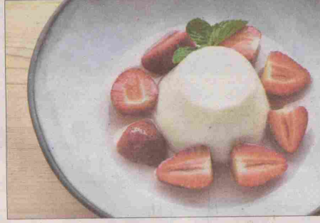
FINALE: Treat yourself to a vanilla panna cotta.