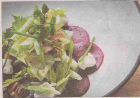
A CLASSIC: A crisp Waldorf salad.

Like the building, the food evolved – or rather, went back in time. Nibble fresh rolls with monogrammed butter (French-style, there are no side plates) while you